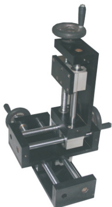
Manual X-Y Slide